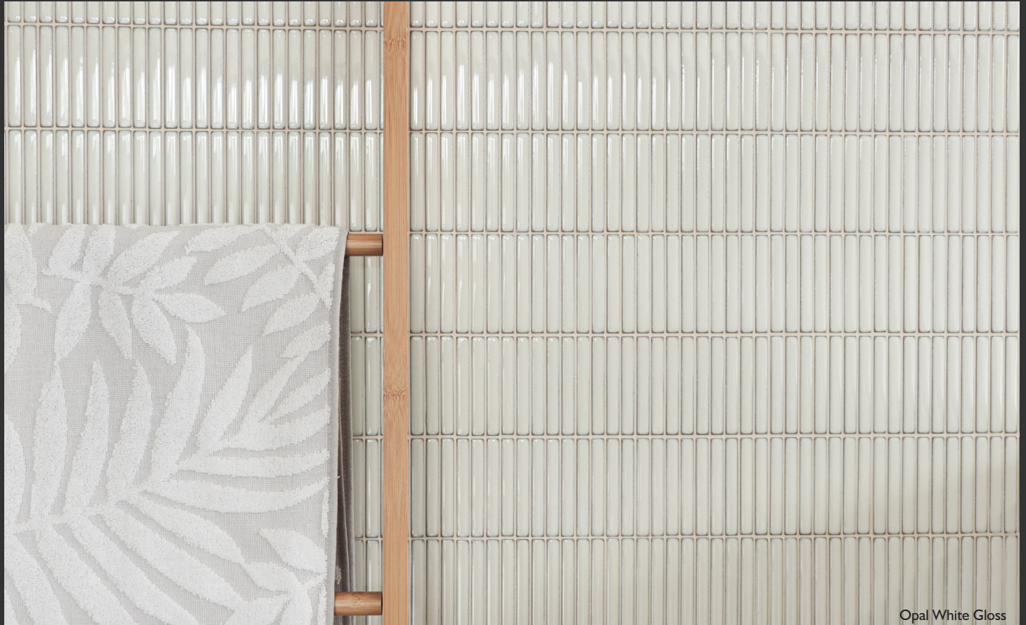
Opal White Gloss