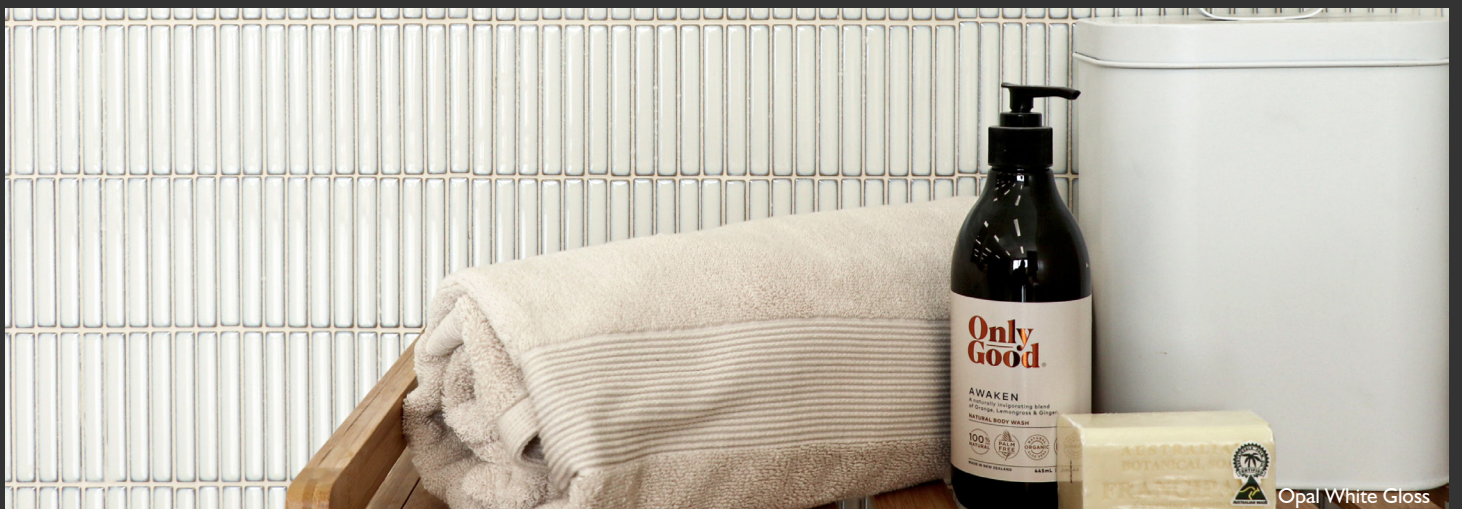
Opal White Gloss