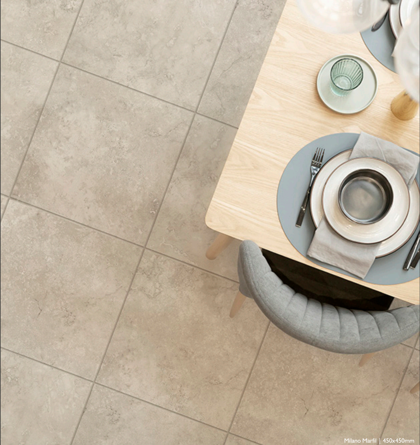
Milano Marfil | 450x450mm