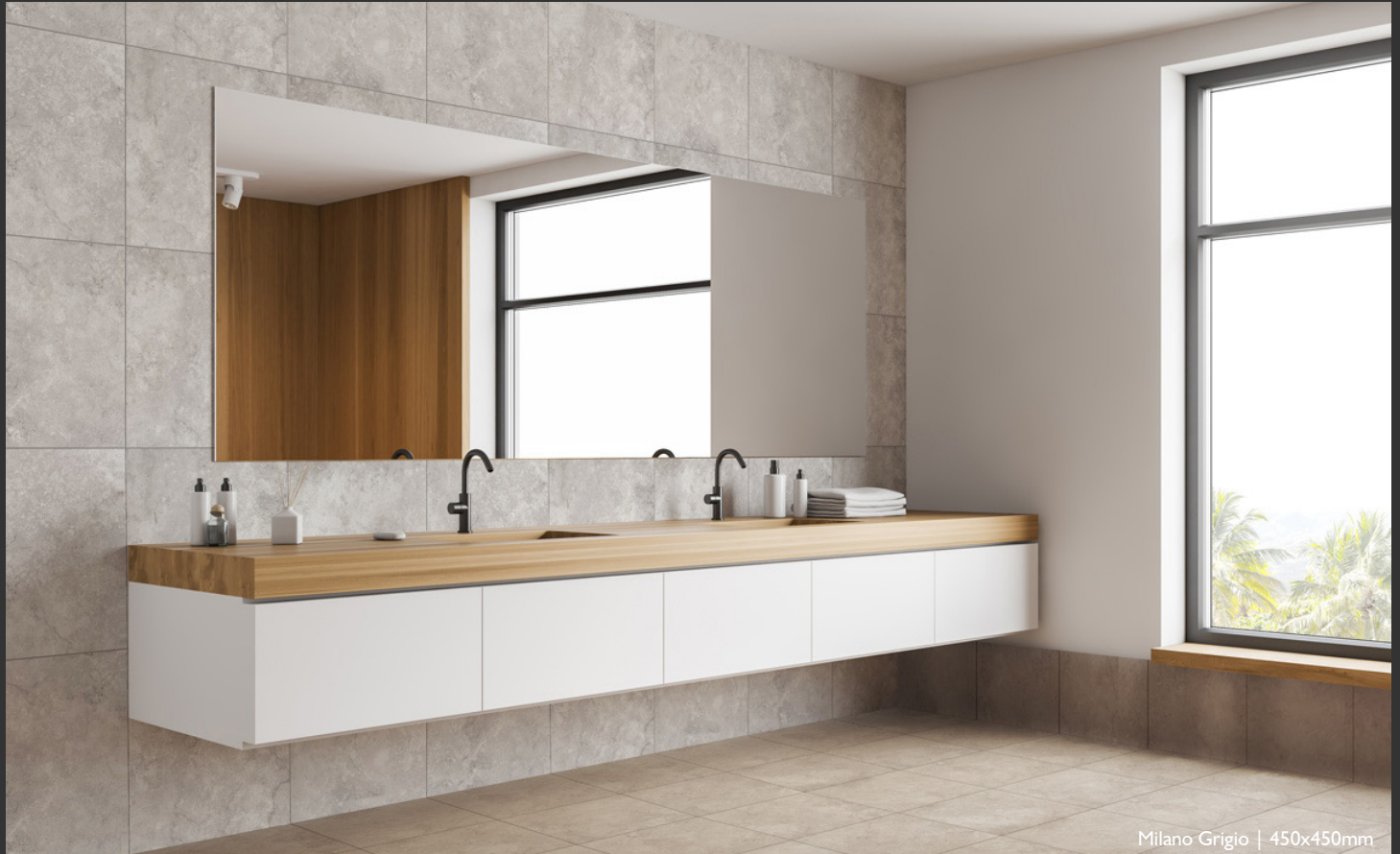
Milano Grigio | 450x450mm