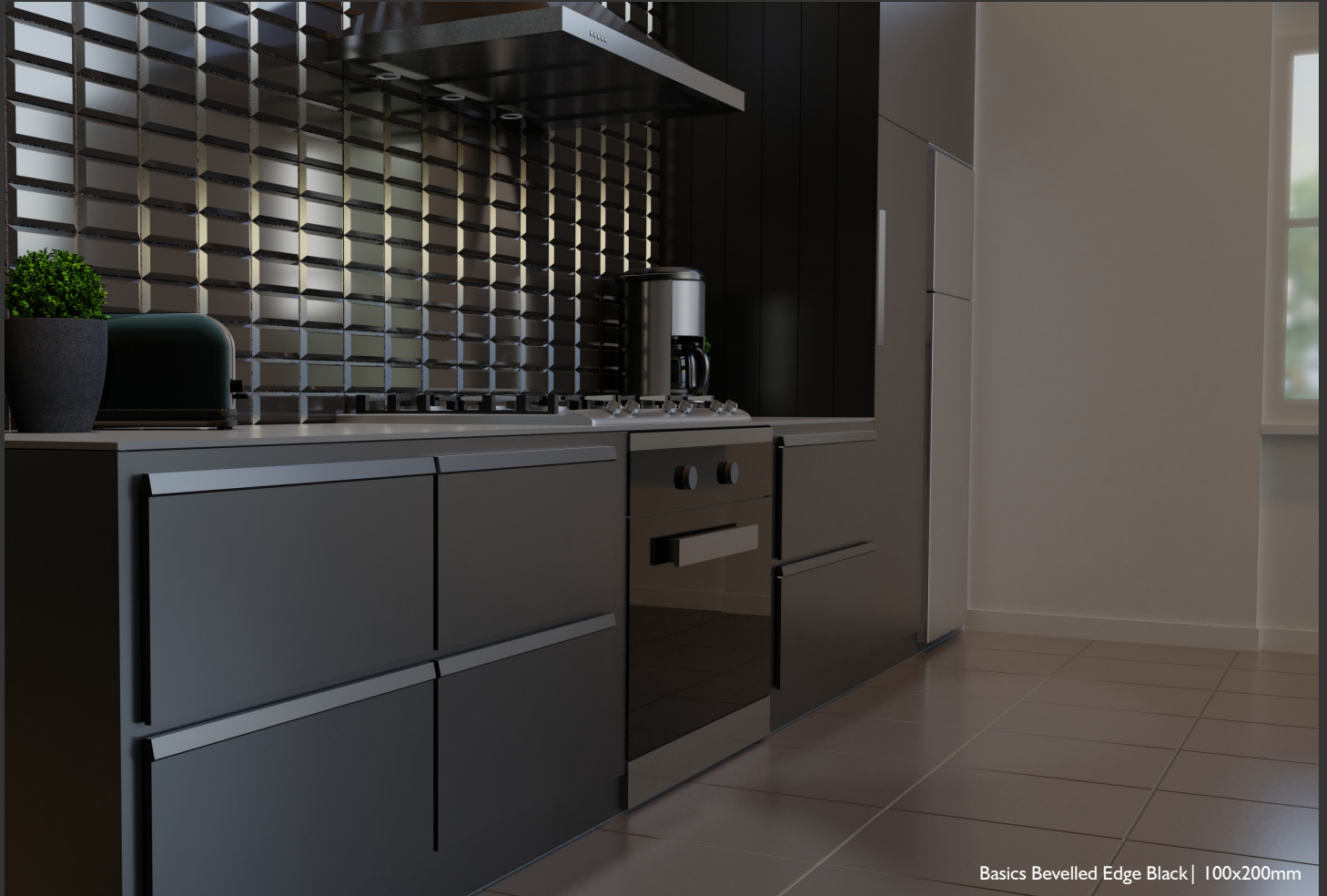
Basics Bevelled Edge Black | 100x200mm